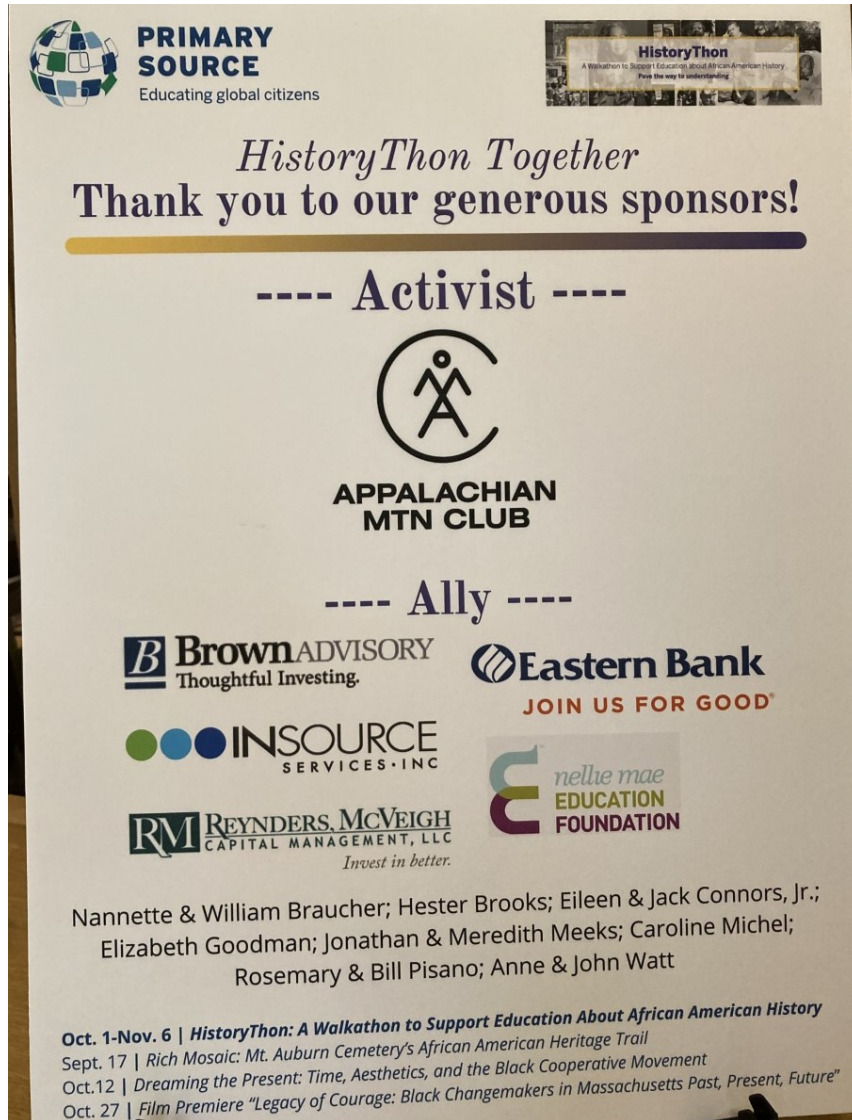
Poster showing appreciation for AMC as an Activist Sponsor for HistoryThon

hybrid event featuring world premiere of the 20 minute film 'Legacy of Change: Black Changemakers in Massachusetts'. This film includes a community discussion guide that will be shared with AMC volunteers and staff. Thank you!